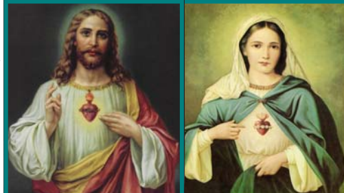
Immaculate Heart of Mary, Pray for us, now and at the hour of our death. Amen.

we ought to work: 1) To grow in virtue and 2) to provide for our needs. Unfortunately, we only think that providing for our needs is important. Over 150 years ago, an American described our nation as: "Men living lives of quiet desperation". Those taking