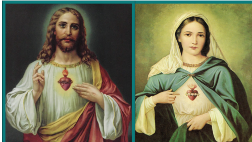
Immaculate Heart of Mary, Pray for us, now and at the hour of our death. Amen.

we ought to work: 1) To grow in virtue and 2) to provide for our needs. Unfortunately, we only think that providing for our needs is important. Over 150 years ago, an American described our nation as: "Men living lives of quiet desperation". Those taking